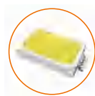
Philips LED Chip