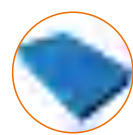
Life Po4 Battery